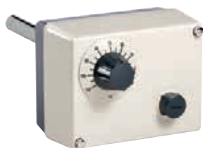
STB + TR