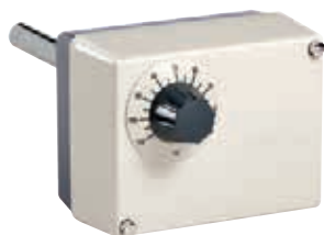
STW + TR